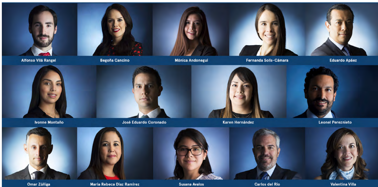
Part of the Creel team that supported WWF.