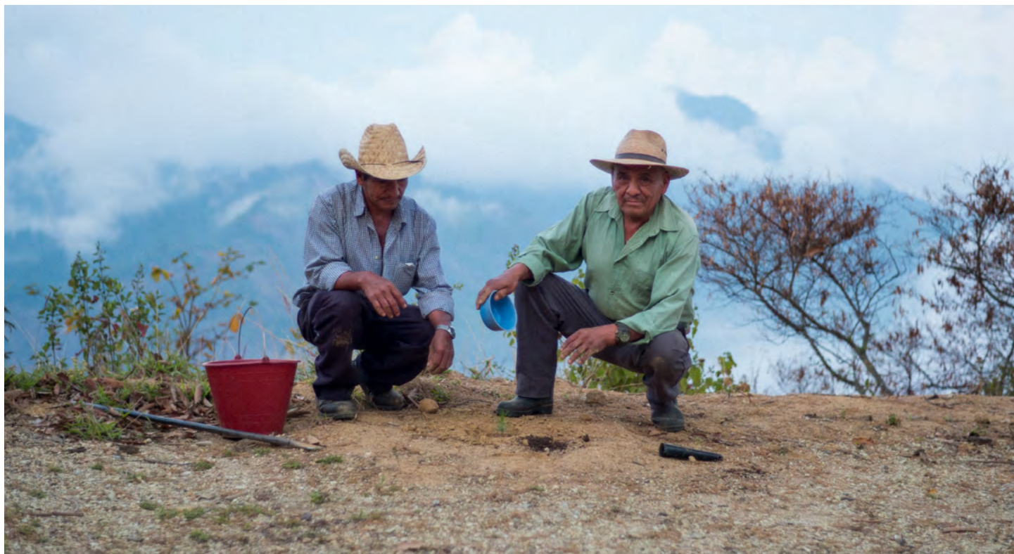
Reforestation at Alternativa Agrícola Suchixtepec, Oaxaca.

A partnership by WWF France implemented by WWF Mexico