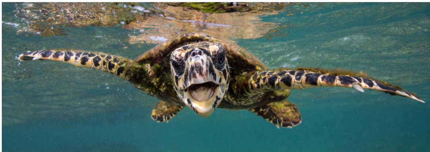
Carey Turtle ( Eretmochelys imbricate ).