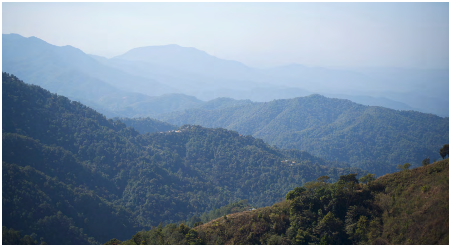
San Miguel Suchixtepec landscape located in the upper part of the Copalita-Zimatán-Huatulco watershed (CZH).