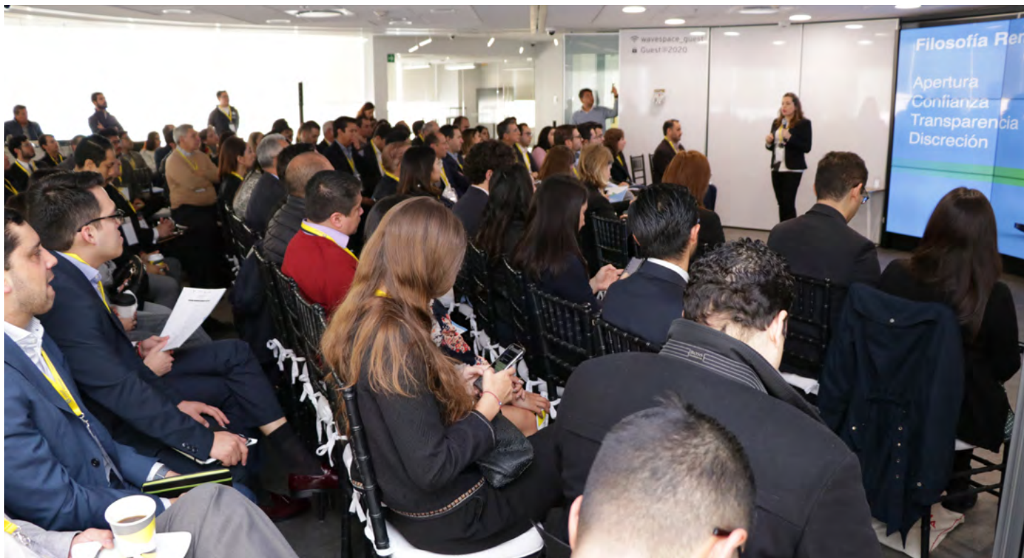
Ren Mex workshop.