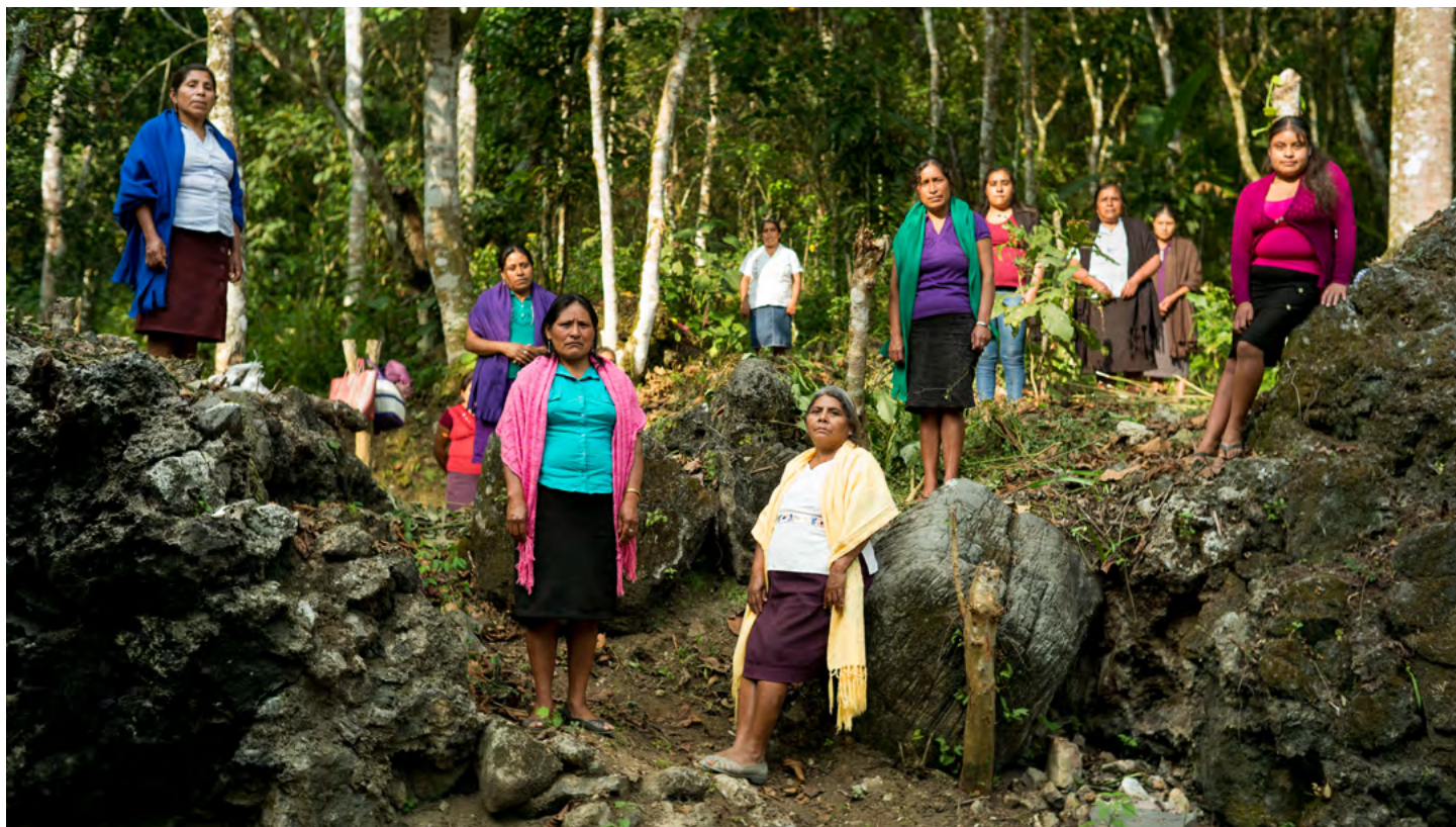
Vanilla producers from San Pedro el Alto, Oaxaca.

Company Name IKEA Social Entrepreneurship