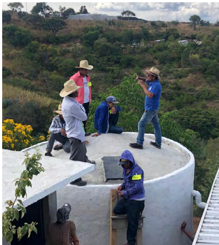
Working with communities of Maestros Mezcaleros, installing a dry toilet and a water harvesting system.